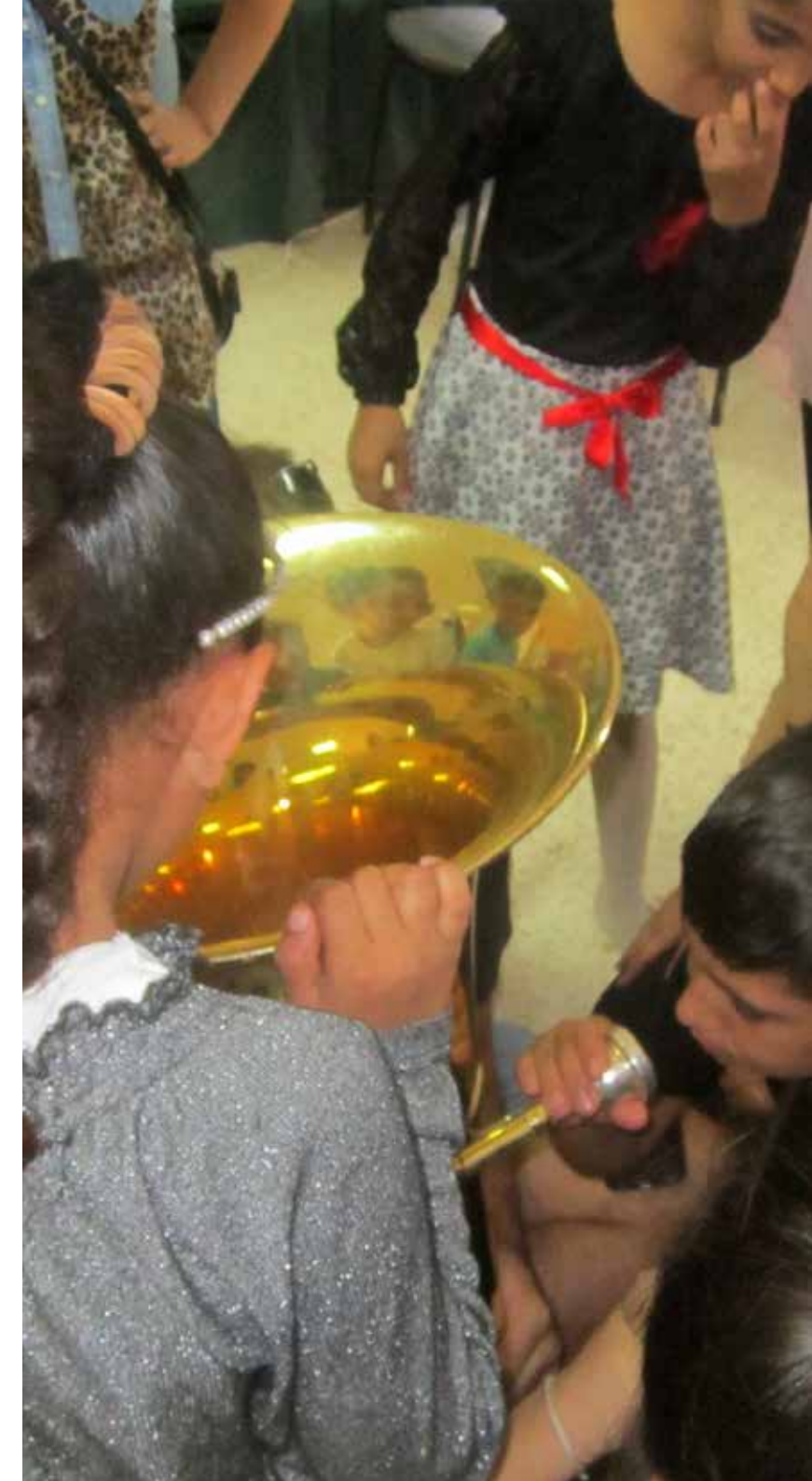
2016 Discovering the Tuba: Educational Workshop by members of the Al-Raseef Band

The Philharmonie reaches out to multiple audiences and to their expectations. Its mediation activities offer a key to cultural discovery.