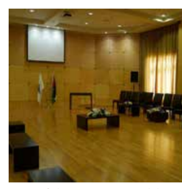
One of the spaces suitable for meetings and chamber music concerts