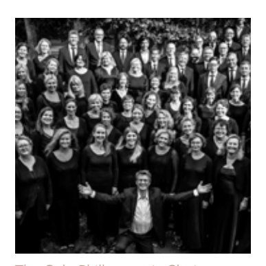
The Oslo Philharmonic Choir, partners in the establishment of the Palestine Philharmonie, performed alongside local choirs in Jerusalem and Bethlehem in December 2016