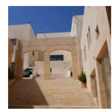
A village of 84 modern spaces available for galleries and artist studios