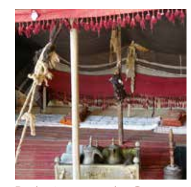
Bedouin tent at the Ottoman Murad Castle museum of the Convention Palace